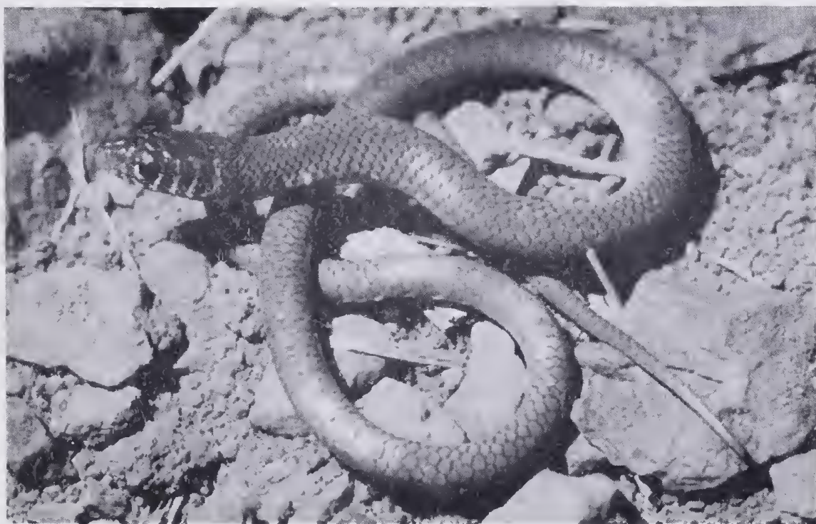
Figure 3 A paratype of Delma haroldi from Marandoo, photographed in life by G. Harold.

Snout-vent length (mm): 48-75 (N 10, mean 62.4). Length of tail (% of SVL): 314-369 (N 4, mean 347). Two pairs of supranasals, anterior in contact with each other (N 8) or separated (2). Loreals 5-7 (N 10, mean 5.4). Fourth upper labial under eye (N 9) or fifth (1). Midbody scale rows 16 (N 9) or 18 (1).